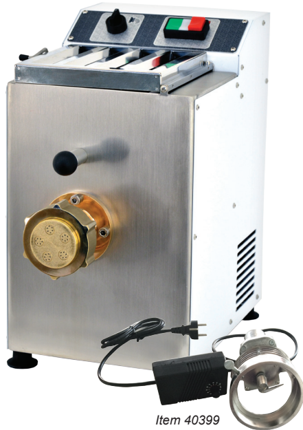
Item 40399 Optional Cutter assembly for PM-IT-0004