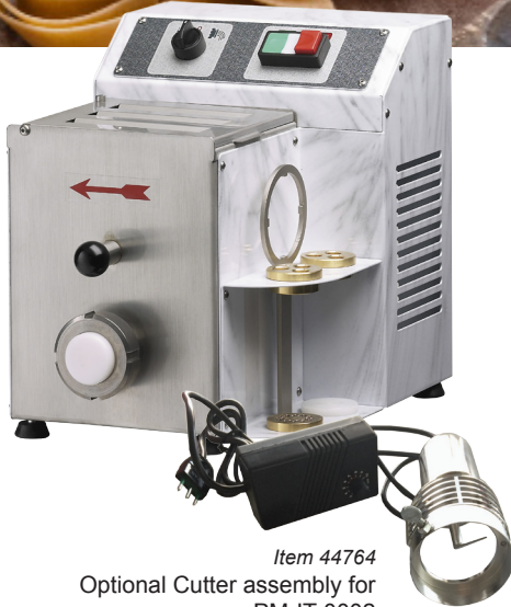
Item 44764 Optional Cutter assembly for PM-IT-0002