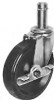
caster with locking brake

For example, model number UAR-64-A/ADG indicates a universal angle rack with the following accessories: locking brakes ("A"), perimeter bumper ("D"), and aluminum pan stop ("G").