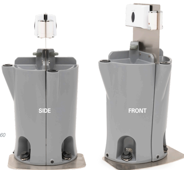
Model #69960 12-gallon