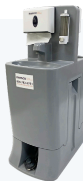
Model #69961 30-gallon